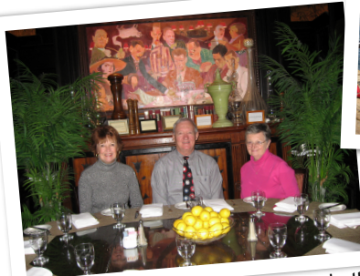
Solo Siblings sucking down Manhattans in Manhattan - Algonquin Hotel