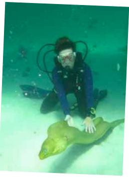
Embracing my inner eel

Unemployment not necessarily a bad thing.