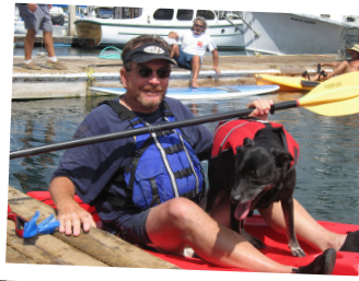
Father/daughter kayak day