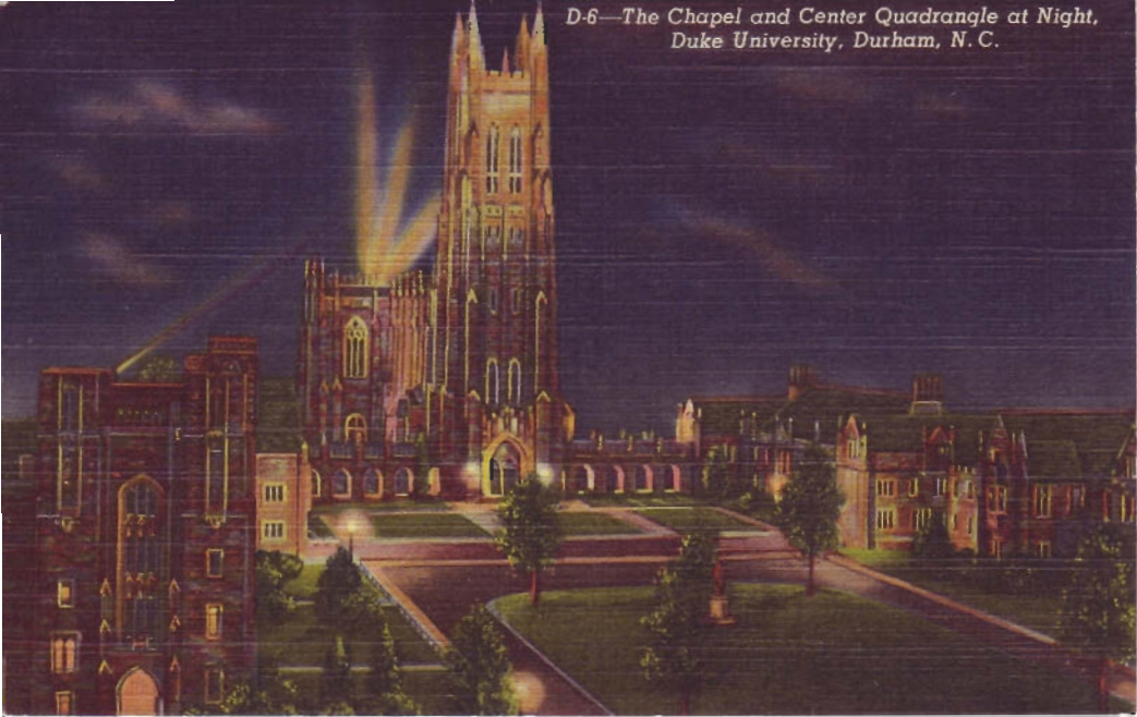
D-6—The Chapel and Center Quadrangle at Night, Duke University, Durham, N. C.